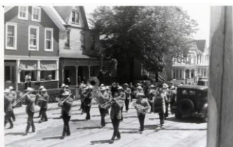
Freeland Memorial Day Parade in 1951

The annual Freeland Memorial Day Weekend festivities are upon us. Every year, attendees can enjoy food booths, a car show, and entertainment throughout the holiday weekend. For decades, citizens of Freeland and surrounding neighborhoods gather together to remember what this holiday is all about: a day of remembrance for those who have died in service to our country.