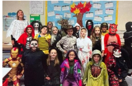
Current 8 th Graders in 3 rd Grade