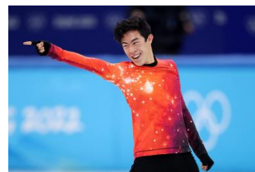
Figure skater Nathan Chen

The Beijing Olympics was not free from scandal, however. Athletes were unable to celebrate with family since spectators were not allowed into watch the events due to Covid-19 protocols. Russian athlete Kamila Valieva tested positive for a banned substance but was still able to compete. Concerns over China's human rights record created many boycotts throughout the games – something they could not seem to escape from.