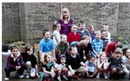
Current 8 th Graders in Kindergarten

I never would have thought that one day I would have to wear a surgical mask to school. And I don't think I'm the first person to say that. Covid took away a whole year from my time at Freeland. That is one day I'll never forget. That day in March when our teachers made us clean out our cubbies, because we didn't know when or if we would come back that year. My friends and I would joke around saying, "See you next year, see you next year!" to all the kids in our classroom. Little did we know we were right. I can't even imagine how hard it was for the