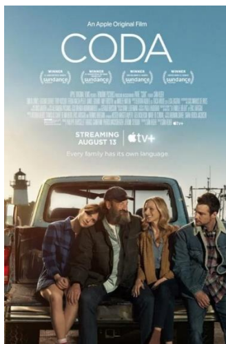
"Coda" won the award for Best Picture at the 2022 Oscars