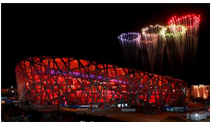
Beijing Olympic Stadium

There were 91 total National Olympic Committees participating in the Beijing Olympics which was selected as the site back in 2015. Beijing is the first city to host both the summer and winter Olympics. Over the course of the two-week event, 17 Olympic records were broken, 2 World records were broken, and 2 countries competed for the first time (Haiti and Saudi Arabia). The Beijing Olympics, although dealing with strict Covid-19 restrictions, powered all Olympic venues with 100% renewable energy – a first at the Olympic Games.